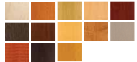
Standard Stain Options

Our versatility allows us to provide both standard and custom profiles.